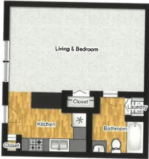
Studio, 1 Bath, 450 sq ft