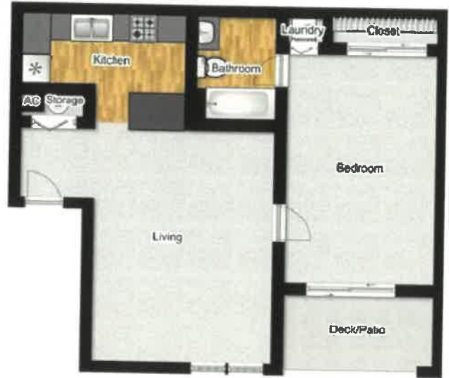
1 Bedroom, 1 Bath, 717 sq ft