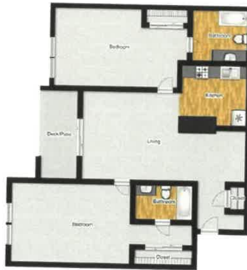
2 Bedroom, 2 Bath, 1100 sq ft